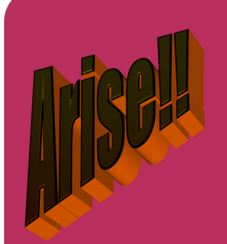
Isaiah 60:1 Arise, shine; for thy light is come, and The Glory of THE LORD is risen upon thee."

GOD has not forgotten you. HE has not left you. Reach for HIM, take hold of HIM. Never let HIM go. HE will be better than your best dreams, greater than your wildest imaginations. Learn HIS Ways, trust HIM, rest in HIM. With GOD, everything, everything is going to be alright!.