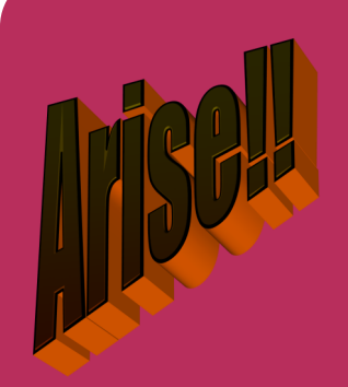
Isaiah 60:1 Arise, shine; for thy light is come, and The Glory of THE LORD is risen upon thee."

GOD has not forgotten you. HE has not left you. Reach for HIM, take hold of HIM. Never let HIM go. HE will be better than your best dreams, greater than your wildest imaginations. Learn HIS Ways, trust HIM, rest in HIM. With GOD, everything, everything is going to be alright!.