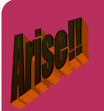
Isaiah 60:1 Arise, shine; for thy light is come, and The Glory of THE LORD is risen upon thee."

GOD has not forgotten you. HE has not left you. Reach for HIM, take hold of HIM. Never let HIM go. HE will be better than your best dreams, greater than your wildest imaginations. Learn HIS Ways, trust HIM, rest in HIM. With GOD, everything, everything is going to be alright!.