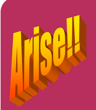
Isaiah 60:1 Arise, shine; for thy light is come, and The Glory of THE LORD is risen upon thee."

GOD has not forgotten you. HE has not left you. Reach for HIM, take hold of HIM. Never let HIM go. HE will be better than your best dreams, greater than your wildest imaginations. Learn HIS Ways, trust HIM, rest in HIM. With GOD, everything, everything is going to be alright!.