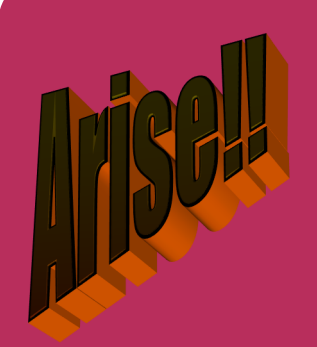
Isaiah 60:1 Arise, shine; for thy light is come, and The Glory of THE LORD is risen upon thee."

GOD has not forgotten you. HE has not left you. Reach for HIM, take hold of HIM. Never let HIM go. HE will be better than your best dreams, greater than your wildest imaginations. Learn HIS Ways, trust HIM, rest in HIM. With GOD, everything, everything is going to be alright!.