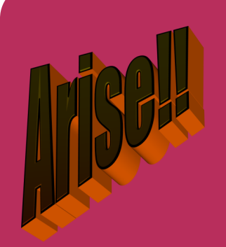
Isaiah 60:1 Arise, shine; for thy light is come, and The Glory of THE LORD is risen upon thee."

GOD has not forgotten you. HE has not left you. Reach for HIM, take hold of HIM. Never let HIM go. HE will be better than your best dreams, greater than your wildest imaginations. Learn HIS Ways, trust HIM, rest in HIM. With GOD, everything, everything is going to be alright!.